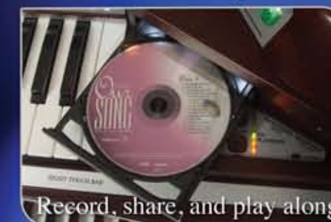
Record, share, and play along