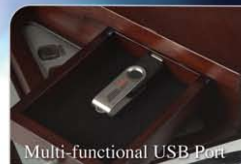
Multi-functional USB Port

The Liberty Bench opens for music storage, is height adjustable, and features a padded back rest